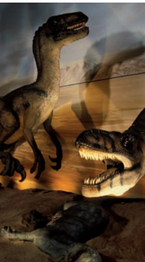
Dinosaur display at Sharjah Natural History Museum

department is authorised to initiate cooperation with prominent international museums and research centres and can hire experts and seek assistance from other local bodies to support its administrative and technical mission.