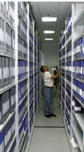
More than 40 television stations broadcast from the UAE.

ARN started Al Arabiya 98.9 FM, a round-the clock Arabic music and news station, in 2001. Soon afterwards, the network launched an English Radio Service, Free FM (96.7 FM) and City FM (101.6). In January 2003 the network launched Al Khaleejiya, thus creating a new platform for Khaleeji (Arabian Gulf) music and giving it a wider reach reflective of the UAE's inherent roots and traditions. HIT 96.7 FM followed and was designed to serve the interest of the largest expatriate community in the Gulf, the Malyalees.