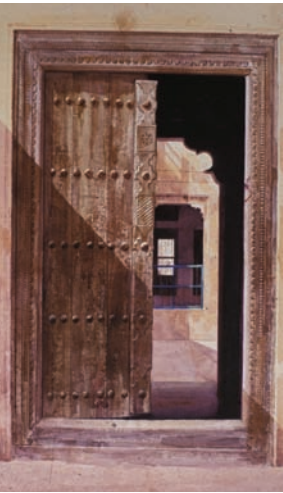
The UAE supports a strong arts movement with a number of its artists gaining international reputations. This painting is by Abdul Qader Al Rayes.

called the Guggenheim Abu Dhabi (GAD), the museum, designed by internationally acclaimed architect Frank Gehry, will position the emirate as a leading international cultural destination. At 30,000 square metres, the Abu Dhabi museum will be the only Guggenheim museum in the region and will be larger than any existing Guggenheim worldwide. It is expected that the museum will be constructed within five years.