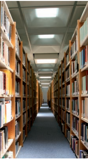
Book cases at the National Library

old, UAE citizens and expatriates alike. Surrounded by gardens and with an open courtyard with fountains, the main building is a dramatic white structure of arches and colonnades, within which are lecture halls, libraries and meeting rooms, as well as ample space on its three floors for displays and exhibitions.